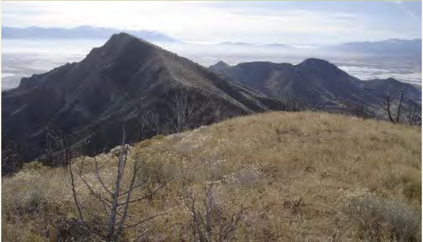
Stansbury Island, December 4

Dec 4, Stansbury Petroglyphs Ride (Paul Kern, 942-8928, kernpr@gmail.com )