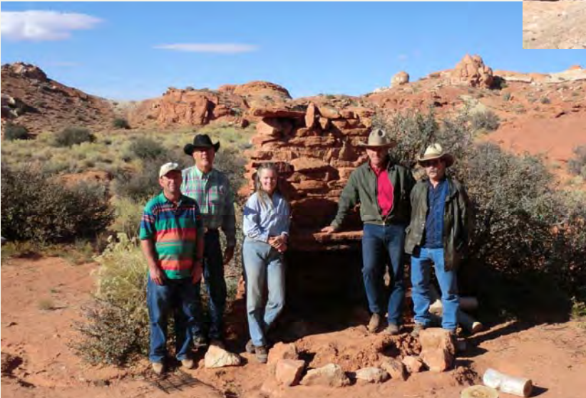
5 Hombres and one Old Chimney at Robbers Roost Escape Slot Canyon >>>